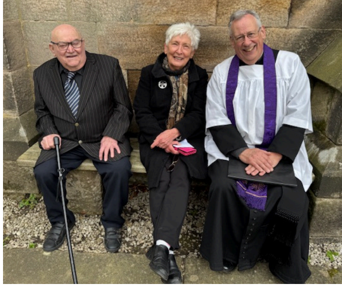
Could this be a caption competition? ...suggestions please!

We pray for the beginning of Passiontide, for a faithful keeping of these days remembering Christ's saving acts and giving thanks for the Victory of the Cross.