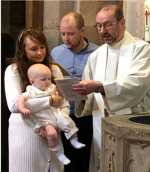
Recent baptism at St Mary's